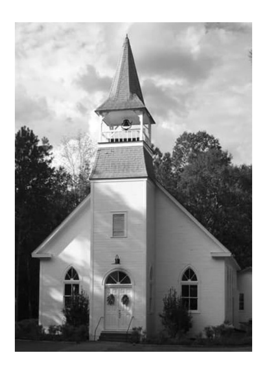
March 10, 2024

A Congregation of the Evangelical Presbyterian Church